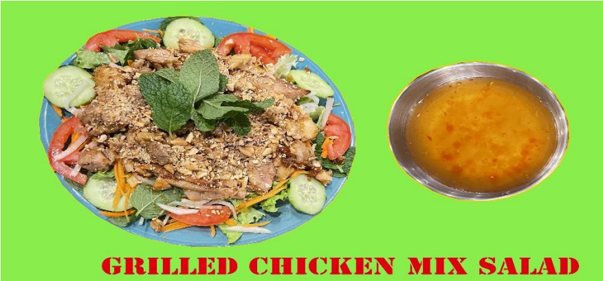
GRILLED CHICKEN MIX SALAD