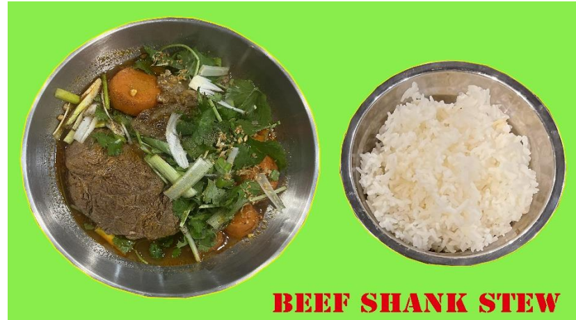
BEEF SHANK STEW