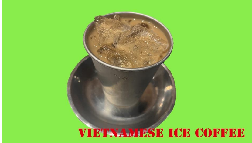
VIETNAMESE ICE COFFEE