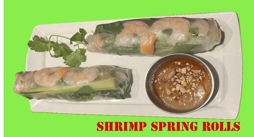
SHRIMP SPRING ROLLS

PLEASE CALL TO ORDER FOR PICKUP: (415) 480-6606