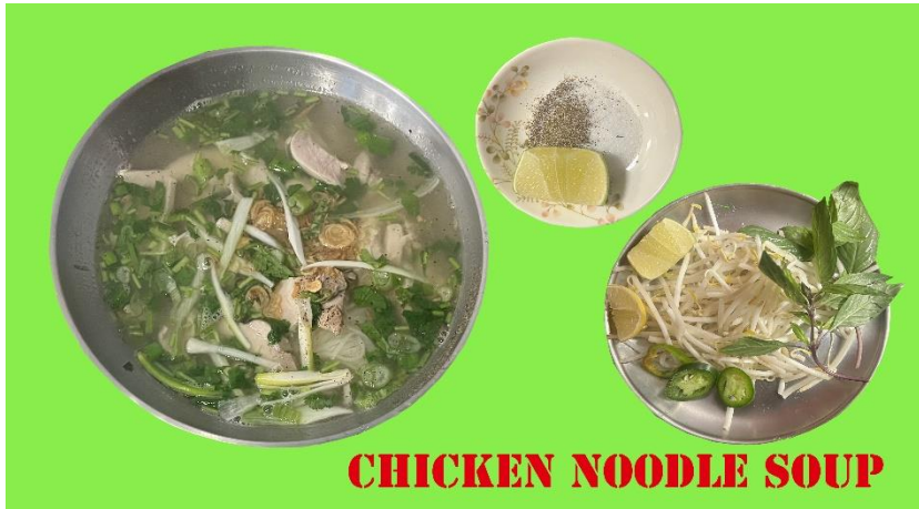
CHICKEN NOODLE SOUP