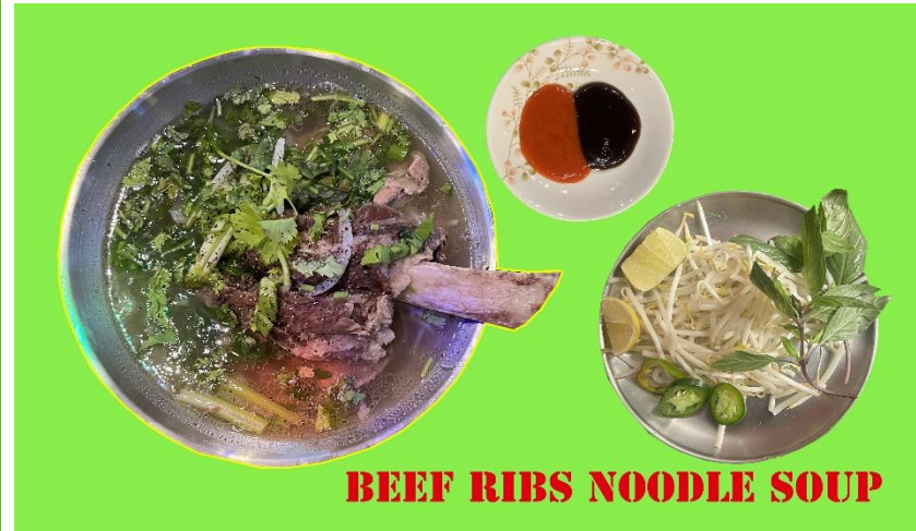
BEEF RIBS NOODLE SOUP