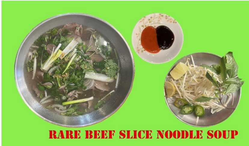
RARE BEEF SLICE NOODLE SOUP