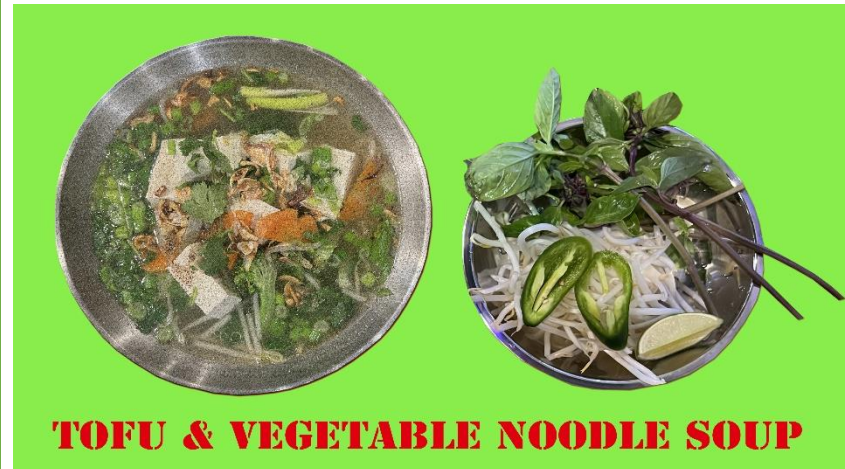
TOFU & VEGETABLE NOODLE SOUP

PLEASE CALL TO ORDER FOR PICKUP: (415) 480-6606