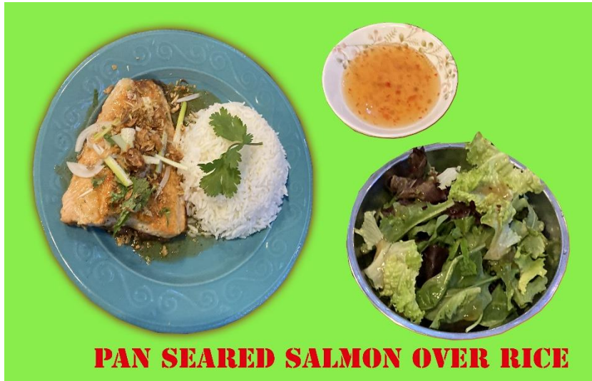
PAN SEARED SALMON OVER RICE

PLEASE CALL TO ORDER FOR PICKUP: (415) 480-6606