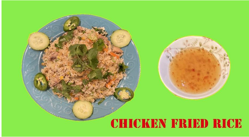
CHICKEN FRIED RICE

STIR FRIED SHRIMP WITH MIX VEGETABLE $16.95