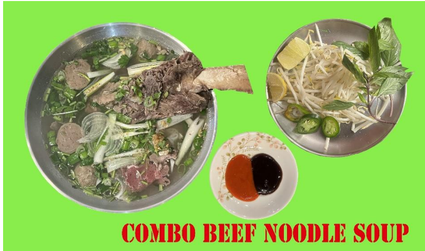
COMBO BEEF NOODLE SOUP

PLEASE CALL TO ORDER FOR PICKUP: (415) 480-6606